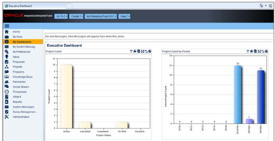
Executive Dashboard in Oracle Instantis EnterpriseTrack

Oracle Accelerate for IT Portfolio Management With Oracle's Instantis EnterpriseTrack™, was developed by Project Partners, LLC and certified by Oracle Corporation to manage Information Technology Portfolio Management (ITPM) processes for a fixed and affordable price. Oracle Accelerate for IT Portfolio Management With Oracle Instantis standardizes, simplifies, and automates the capture and allocation of IT costs to the lines of business for which IT services are performed. It is ideal for organizations that want better insight into cost drivers, to facilitate decision-making and project prioritization, and to drive growth.