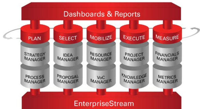
Figure 3. Key modules enable process improvement teams to manage the entire project lifecycle.

The EnterpriseStream module of Instantis EnterpriseTrack is the first and only purpose-built and seamless collaboration and social networking capability for PPM practitioners and stakeholders across the enterprise. As a result, there is virtually zero effort to set it up, access the tool, start collaborating, and realize immediate productivity results.